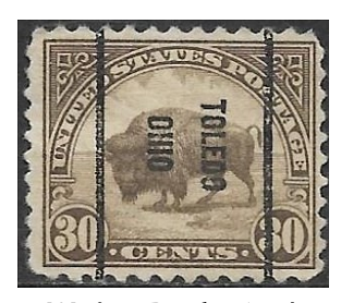
We're Back. And that's no bull!

We are looking forward to resuming our annual one-day show. Of course, we will need help setting up and taking down. Details of when we need you will be discussed at our September meetings.